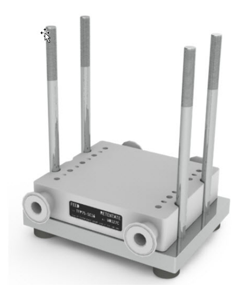
Figure 6.1 Sanitary fitting connections