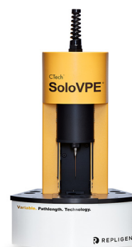
Figure 2. Variable-pathlength UV-Vis absorbance readings