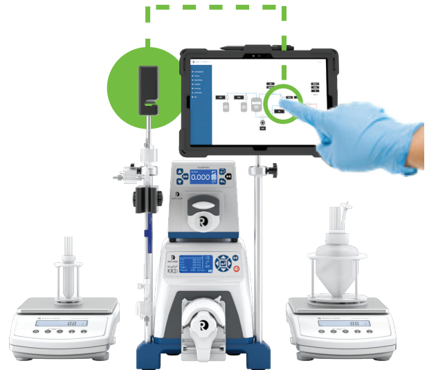
UF/DF process parameters vs time