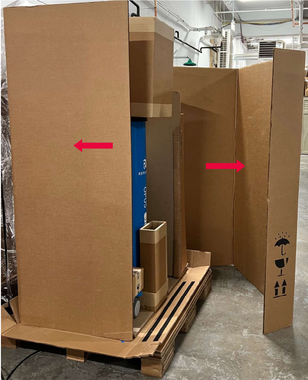
Figure 4. Sidewalls

Lift and remove both sidewalls from crate base ( Figure 4 ).