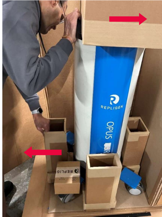
Figure 9. Removing support blocks

Note: The rear L-shaped bottom support block is stationary and cannot be removed.