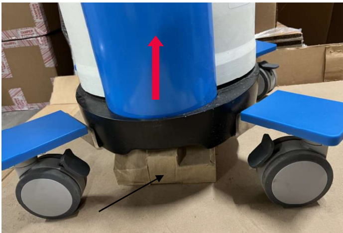
Figure 12. Removing the column

Caution: Do NOT grab the column by the white inlet and outlet ports on the black top cap.