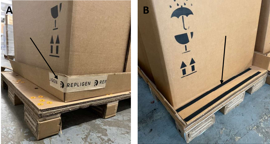
Figure 2. Tape and hook and loop

Cut open the four tapes on the bottom tray of the crate ( Figure 2A ) and fold down the flaps to expose the hook and loop strips ( Figure 2B ).