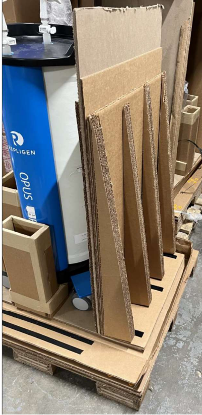
Figure 7. Ramp

Remove the ramp and lay on the ground facing the crate side with hook and loop strips ( Figure 7 ).