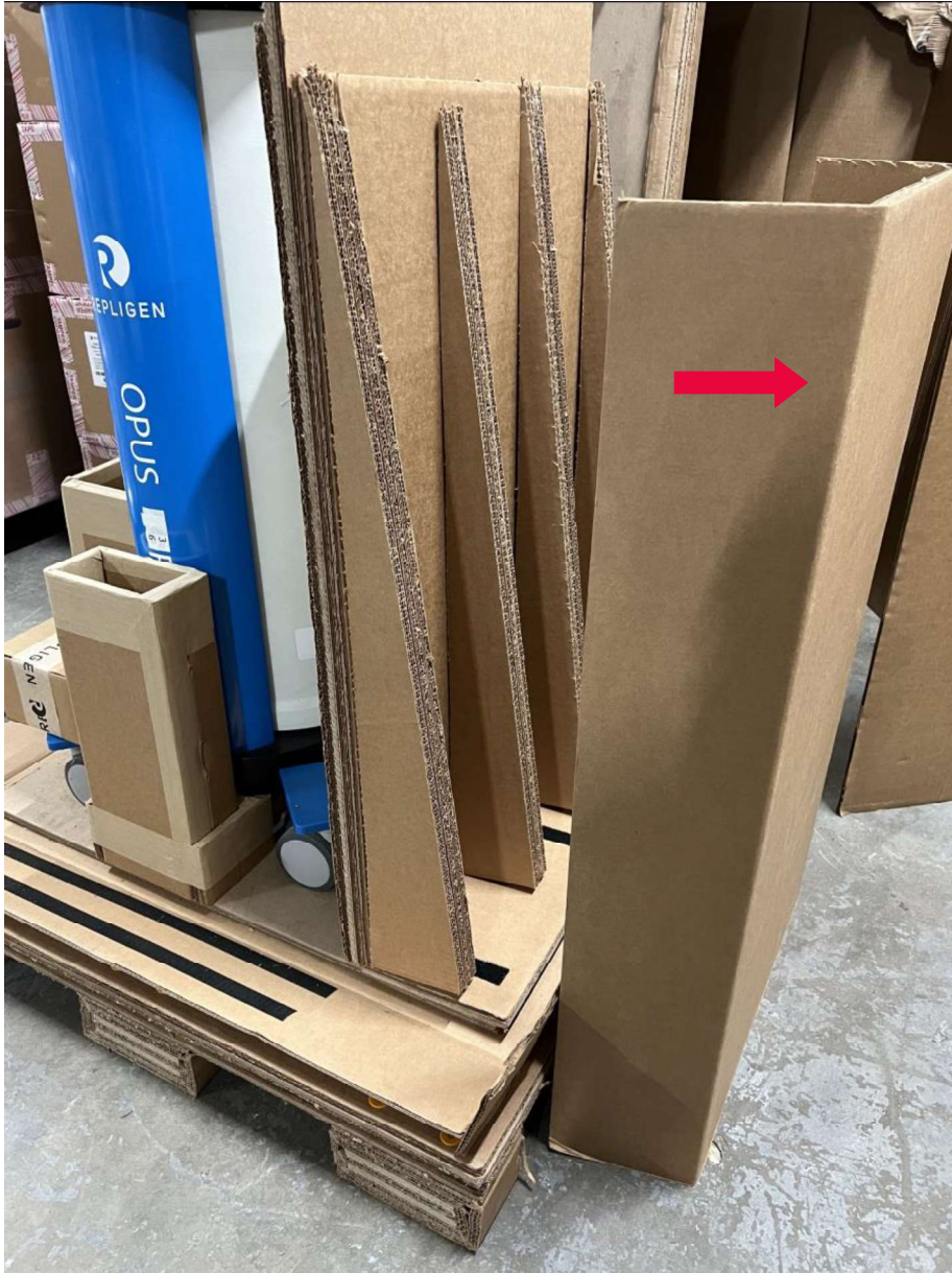
Figure 6. U-sheet

Remove the U-sheet from far-right ( Figure 6 ).