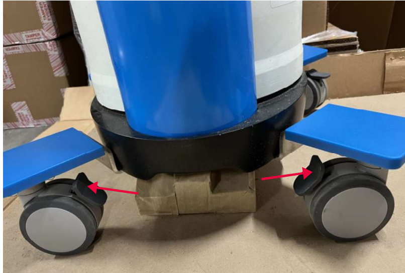
Figure 11. Casters

Step 12. TWO OPERATORS are needed to remove the column from the crate. Slightly lift and push the column off the support beam (Figure 12A) and GENTLY roll it off the ramp (Figure 12B).