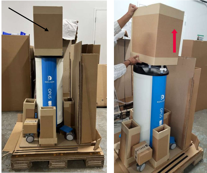
Figure 5. Collar

Remove collar ( Figure 5 ) from the column.