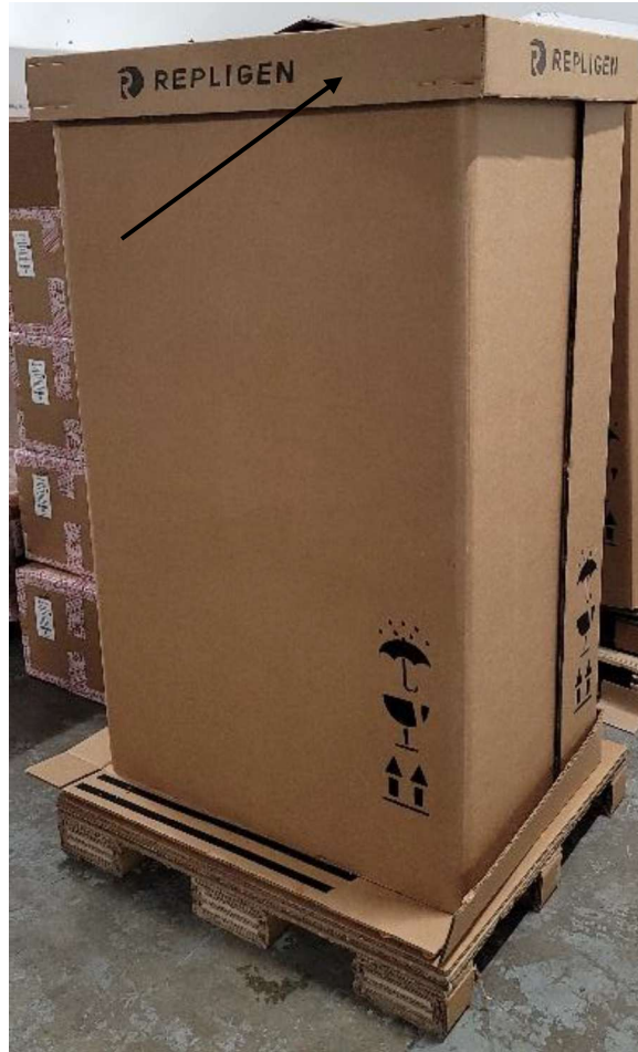
Figure 3. Lid