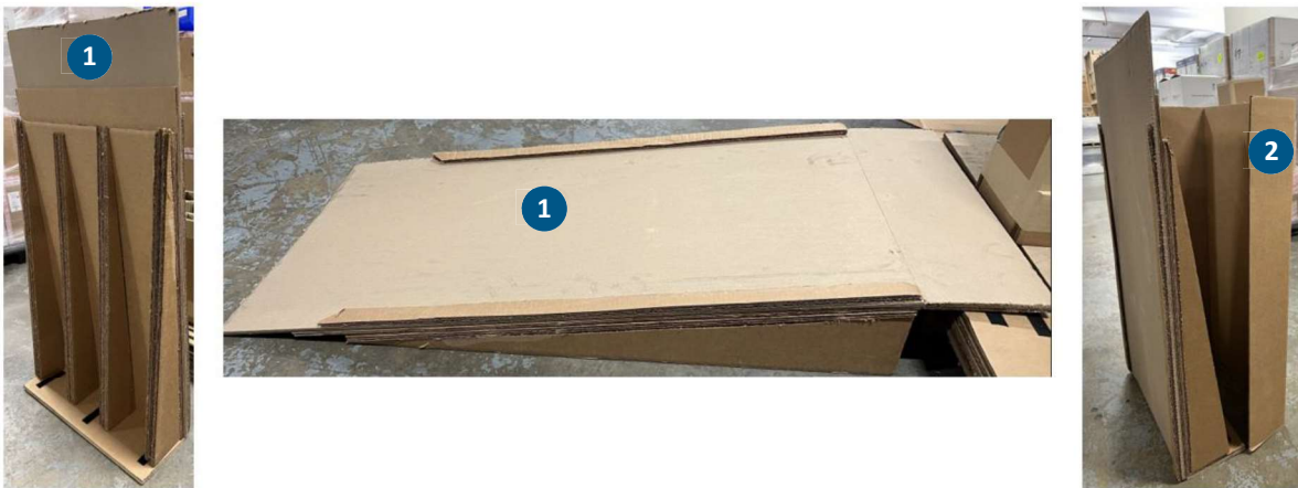
Figure 1. Ramp and U-sheet